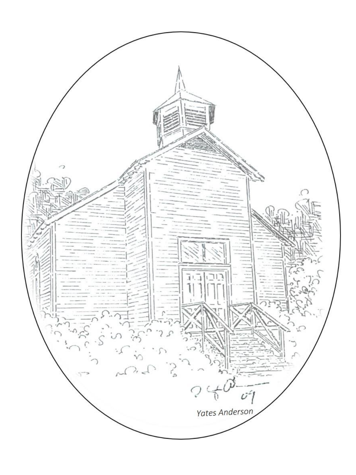
Lake Toxarvay United Methodist Church Sunday, October 11<sup>th</sup>, 2020